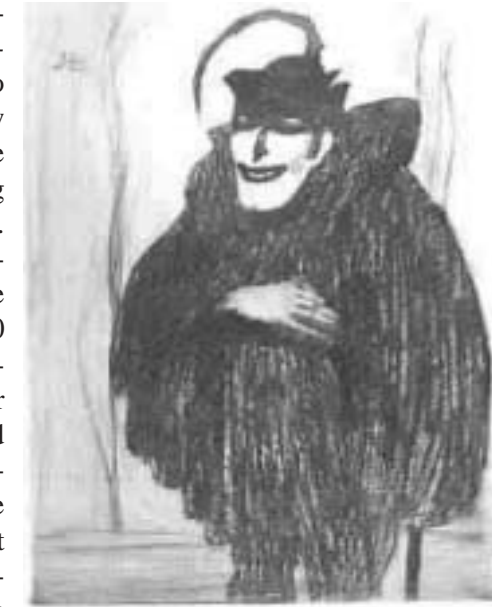
Masked Figure, Mephisto, 1910