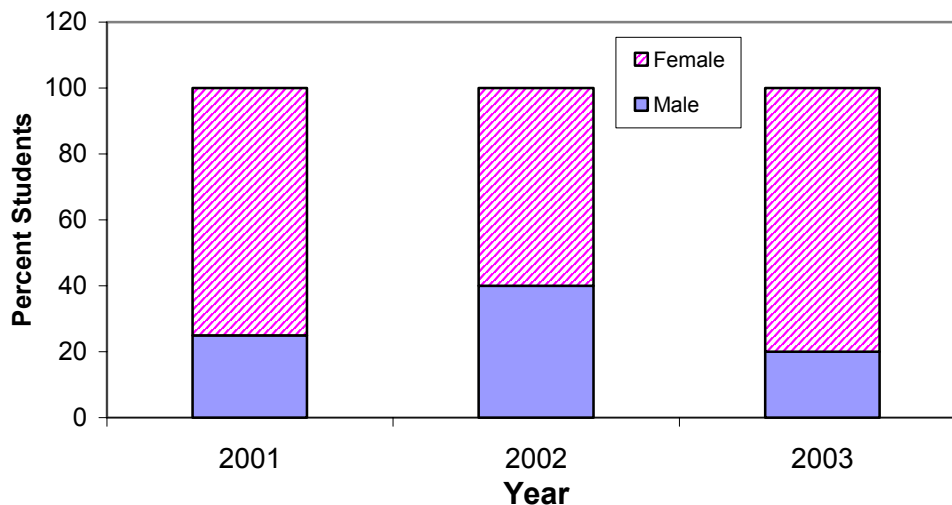
Figure 2: Male and Female participants in Project Fulcrum 2001-2003.

A second aspect of the institutional impact is the ability to raise campus-wide attention about the climate for women in science, math and engineering. Our participants are overwhelmingly female (Figure 2). Each year, the percentage of women has been greater than 60%. While not unusual for the population as a whole, the availability of women in the pool of graduate students is approximately 25%. This encourages discussions about the impact of gender in science education at both the K-12 and the graduate level.