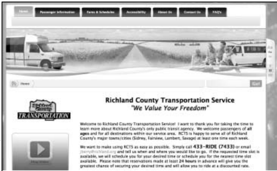
Richland County, Virginia