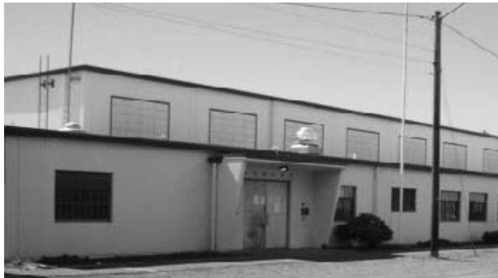
Mason Transit in Shelton, WA, purchased the downtown Shelton Armory with plans to develop a combined community center and expanded transit center.