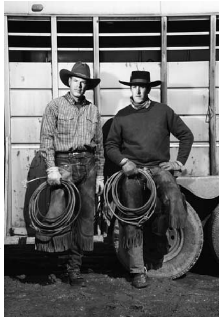
Your drivers won't have to wear fancy duds or use lariats for a transit rodeo, but they will be demonstrating their skills and competing with peers as they learn from each other.

3) Driving course. The driving course has a time limit of 7 minutes. Seat belts are required for the driver and on-board