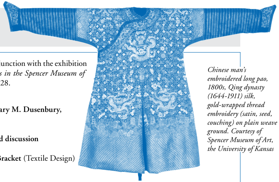
Chinese man's embroidered long pao, 1800s, Qing dynasty (1644-1911) silk, gold-wrapped thread embroidery (satin, seed, couching) on plain weave ground.

The words text and textile are both derived from the Latin texere/textus , meaning to construct and to weave. Texts and textiles come into existence through the creation of a structure – of words or of thread – and both can carry imbedded meaning and convey it to an audience who can “read” it.