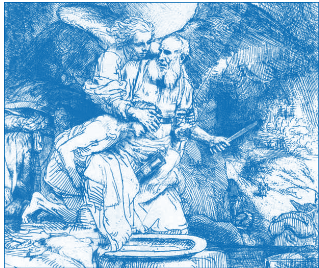
Rembrandt, Abraham's Sacrifice (1655).

For the final lecture in the series on March 21, Reza Aslan , scholar of comparative religion and author of No god but