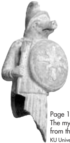
Page 1 nameplate: The mysterious armed pig from the Wilcox Collection KU University Relations